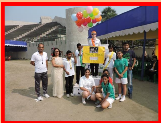
The children of an NGO-Premashree participated in a special event..