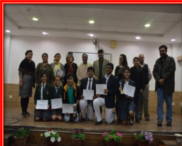
The Winners of all the different categories with the organisers and Guests Of Honour.