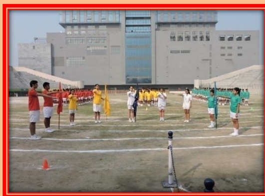
The oath taking- the School Captain, School Vice Captains, House Captains and House Vice Captains.