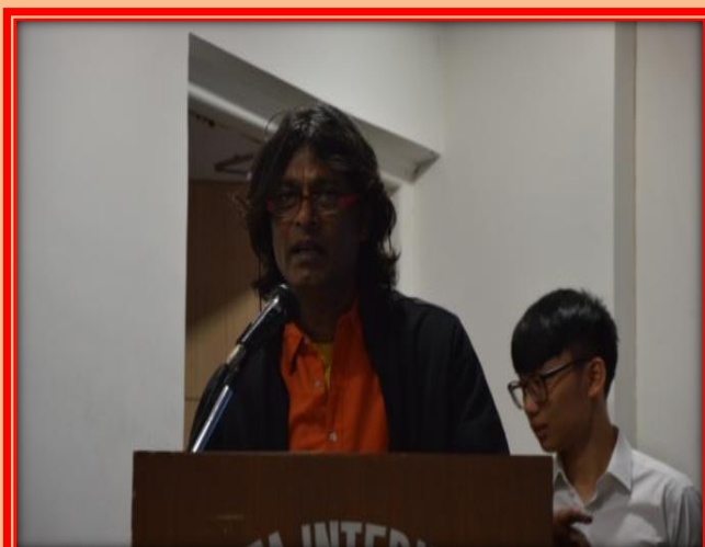
Aviroom Sen, senior journalist and writer of the bestselling book Aarushi.

The Interschool Humanities Meet took place on 27 th January, in the school premises. Twelve different schools of Kolkata (across the entire spectrum), participated in this seminar-' Politics of Images'. All the students spoke with elan and conviction. The questions at the end of each presentation was very illuminating and many challenging ideas were circulated.