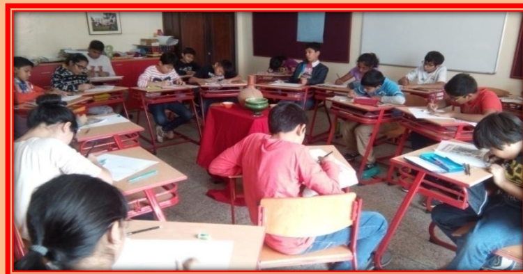
The Art Examination in class 6 A.

The Mid-Term examination for 6 th to the 12 th grades took place after our winter vacation. The examinations were challenging but most students said that it was worth taking these as they felt ' it was an amazing experience!'.