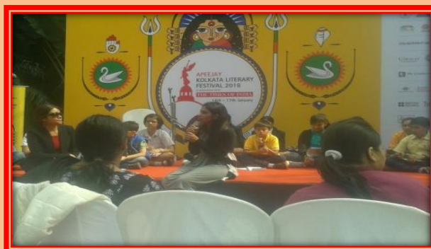
A participant 'singing a story'