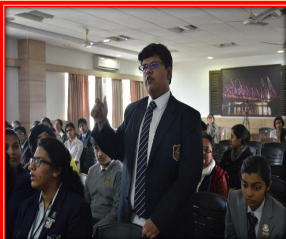
A participant put forward an idea which created a lasting impact on the audience.