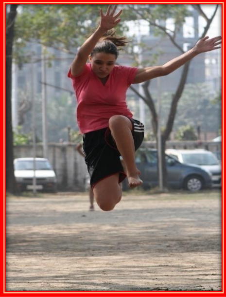
The second round of Tug of War. In the first round the rope tore!